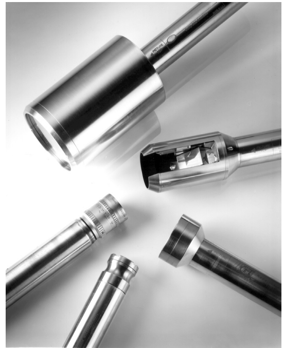
R93 Lens Bodies