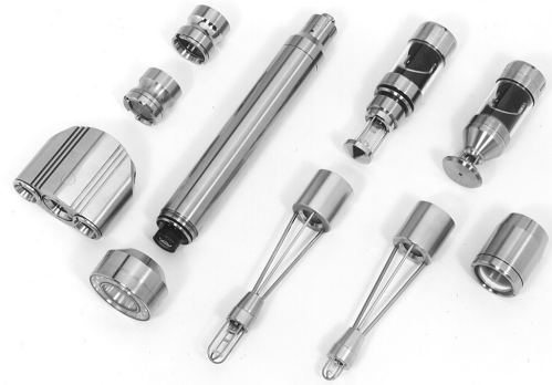
R93 Viewing Heads

For integrated system applications the R93 can easily be interfaced with central switching units and remote control panels. Control systems using PC driven SCADA control techniques are also available.